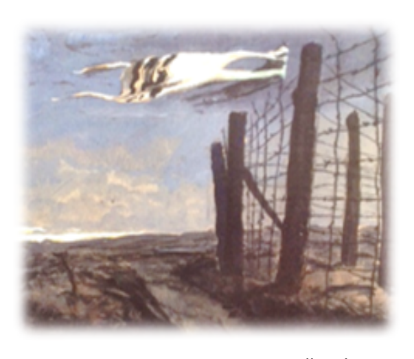
Artist: Zinovii Tolkatchev

"Thus says the LORD, Who gives the sun for a light by day, the ordinances of the moon and the stars for a light by night, Who disturbs the sea, and its waves roar (the LORD of hosts is His name): If those ordinances depart from before Me, says the LORD, then the seed of Israel shall also cease from being a nation before Me forever." Jeremiah 31:35,36